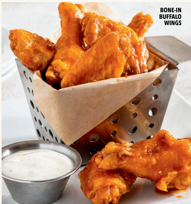
BONE-IN BUFFALO WINGS