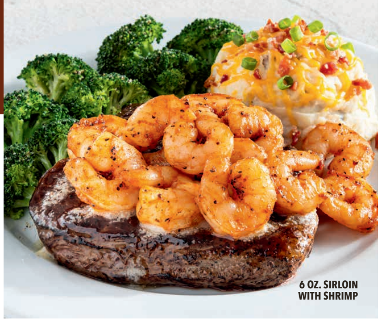
6 OZ. SIRLOIN WITH SHRIMP

Seasoned & topped with garlic butter. Served with loaded mashed potatoes, seasonal veggies. 32.50