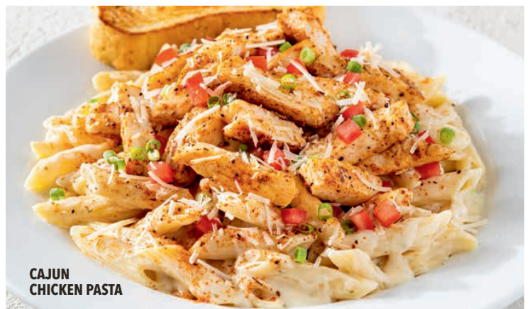
CAJUN CHICKEN PASTA

Salmon, lightly brushed with garlic butter & herbs. Served with Mexican rice and seasonal veggies. 28.40