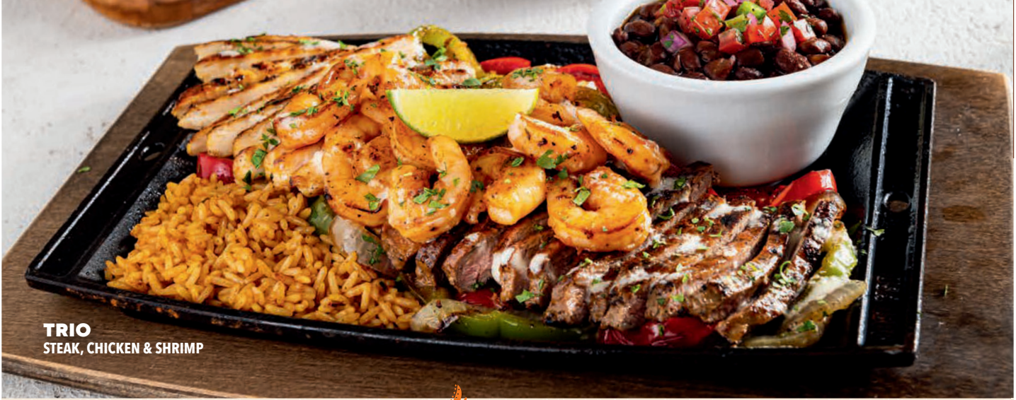
TRIO STEAK, CHICKEN & SHRIMP