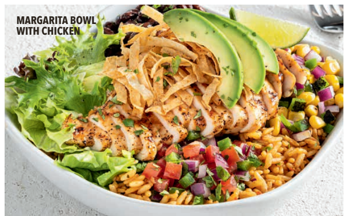
MARGARITA BOWL WITH CHICKEN

House-made pico, field greens, rice, corn salsa, avocado, shredded mixed cheese, tortilla strips, cilantro, chipotle pesto, house-made ranch. With grilled chicken 19.50 With shrimp 19.50 With steak 21.50 With veggies 19.50