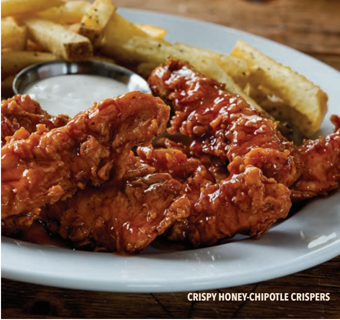
CRISPY HONEY-CHIPOTLE CRISPERS