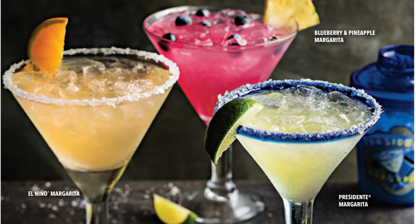
BLUEBERRY & PINEAPPLE MARGARITA