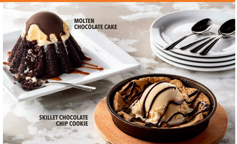
MOLTEN CHOCOLATE CAKE

Served with fresh fruit and strawberry puree. 11.00