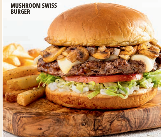
MUSHROOM SWISS BURGER

* NOTICE: MAY BE COOKED TO ORDER. CONSUMING RAW OR UNDERCOOKED MEATS, POULTRY, SEAFOOD, SHELLFISH OR EGGS MAY INCREASE YOUR RISK OF FOODBORNE ILLNESS, ESPECIALLY IF YOU HAVE CERTAIN MEDICAL CONDITIONS.